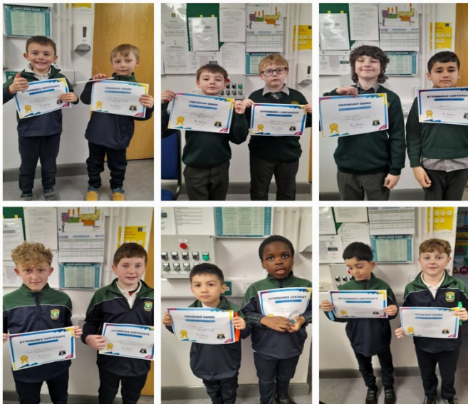
Above and below: Boys who received certificates/prizes for showing acts of kindness/friendship toward their peers and for full attendance in recent weeks. Well done boys!

Variations in colour, different brands e.g. Addidas, Nike etc are not permitted. The plain navy shorts/tracksuit to the left are examples of what is acceptable and these are available in most large clothing stores. If these are not available on a particular day, pupils should wear their school uniform.