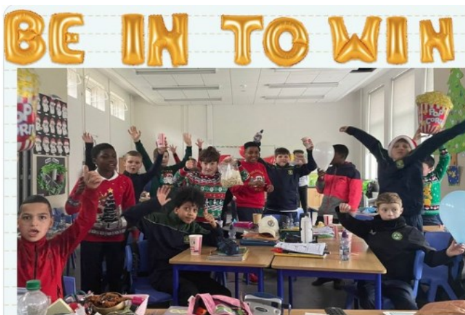
Popcorn Party to celebrate 4th class' excellent attendance

Strive for 5. Be in school 5 days a week.