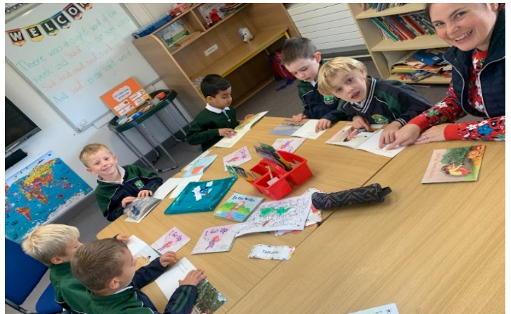
Literacy work above in Senior Infants

The staff and Board will complete our annual review of our Anti-bullying policy and the school's Statement of Strategy for School Attendance. If parents would like to view the current policies they can be accessed under the Downloads tab on our website. Suggested amendments (if any) are welcome and can be forwarded to admin@ferrybankbns.ie before 3pm on Friday 2nd February.