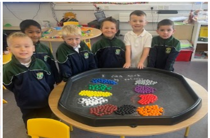
Ready Set Go Maths Activities in our Junior and Senior Infant Rooms.