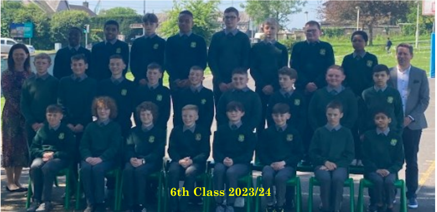
6th Class 2023/24