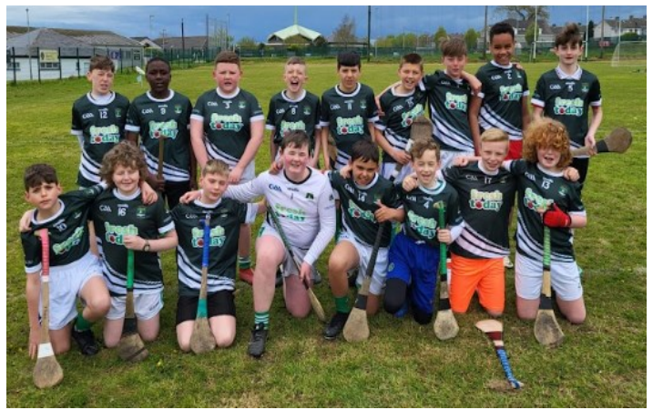
Pictured above: Our U-13 hurlers wearing the new jerseys sponsored by Freshtoday.

Pictured below: Members of our athletics team who competed in the RSC in recent weeks.